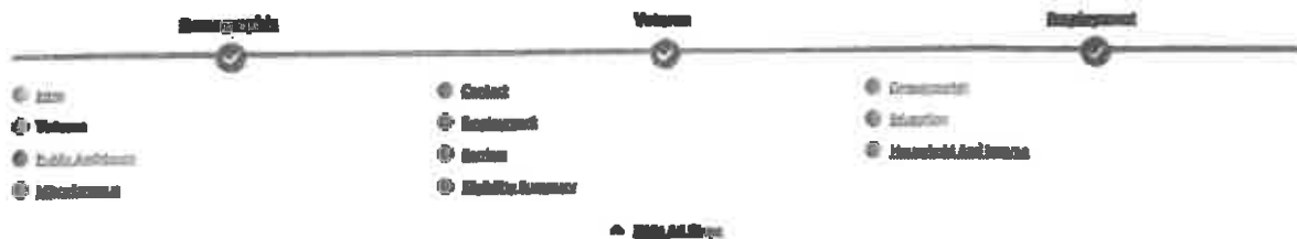
Title I - Workforce Development (WIOA)